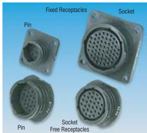
Fixed Receptacle Dimensions