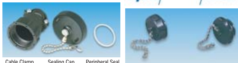
Cable Clamp Sealing Cap Peripheral Seal