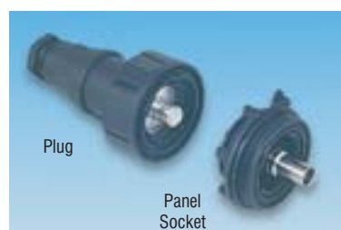
Cable entry = 6 - 8.1