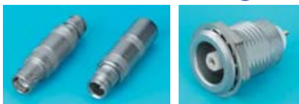
Straight Plug L=42mm A=13mm