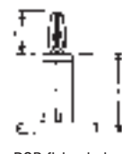
PCB fixing hole=4.0