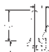
PCB fixing hole=4.0