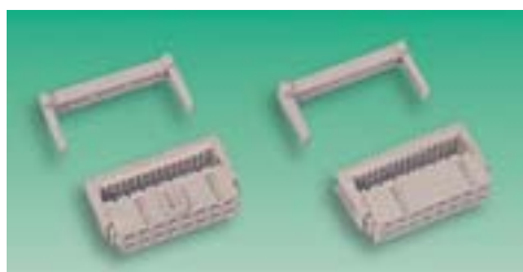
Bump/Clip polarisation 248-988 Clip polarisation 249-063