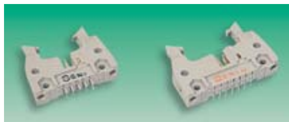
Vertical PCB mounting 249-129 Right angle PCB mounting 249-210 Mounting holes accept M2.5 bolts or No. 4 self tappers