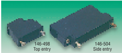
146-498 Top entry