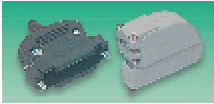
146-507 Top entry Style A 315-886 Side entry Style B